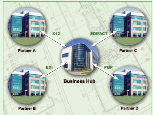
Psypher Security Suite provides the optimum level of security for your trading partner community.

PsypherEDI is used by the sender and receiver to secure any type of data transmitted between locations. It is typically used to provide security for closed trading communities that are made up of a large company as the hub, and trading partners as the spokes. PsypherEDI supports field-level encryption so you may selectively and efficiently secure sensitive fields in your files, thus reducing encryption time. PsypherEDI transfers a range of file sizes, including large files over 4GB, and translates between EBCDIC on mainframes and ASCII on other computers.